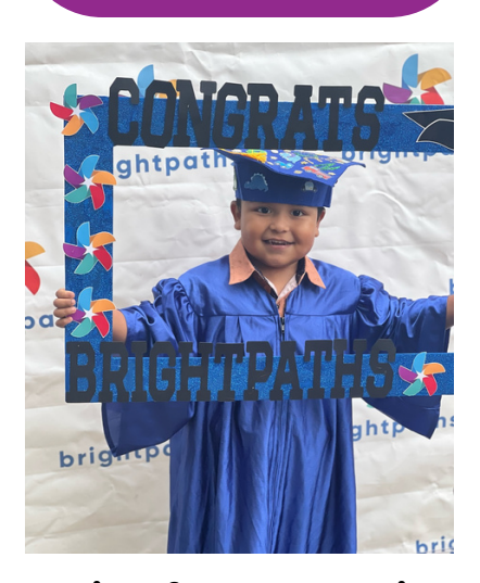
Pins for Prevention

A family-friendly back to school event with bowling and family fun at Showtime Bowling.